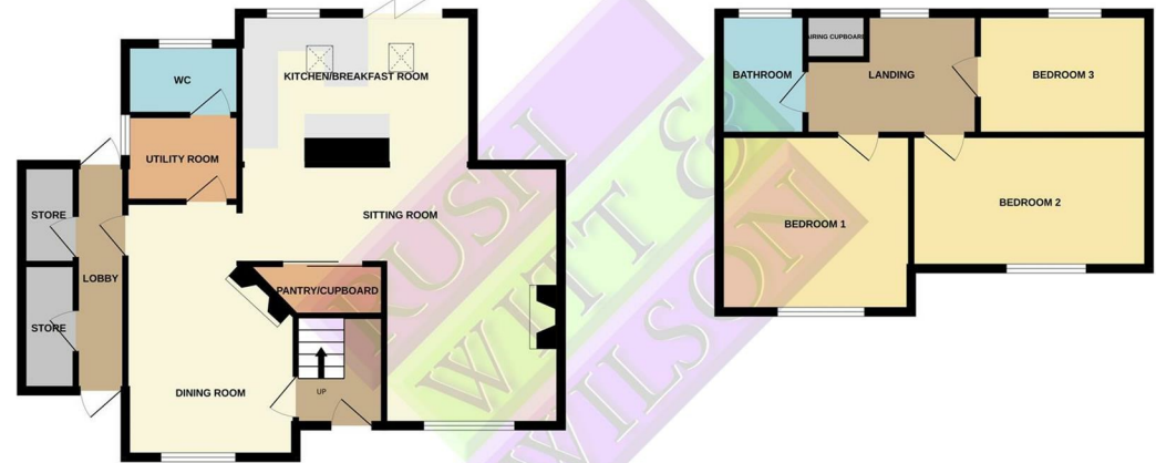
TOTAL FLOOR AREA : 1181 sq.ft. (109.7 sq.m.) approx.

Whilst every attempt has been made to ensure the accuracy of the floorplan contained here, measurements of doors, windows, rooms and any other items are approximate and no responsibility is taken for any error, omission or mis-statement. This plan is for illustrative purposes only and should be used as such by any prospective purchaser. The services, systems and appliances shown have not been tested and no guarantee as to their operability or efficiency can be given. Made with Metropix ©2024